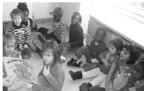
Children enjoying a story at Circle Time