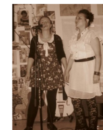
OPEN MIC - Talent in Porte na Failte