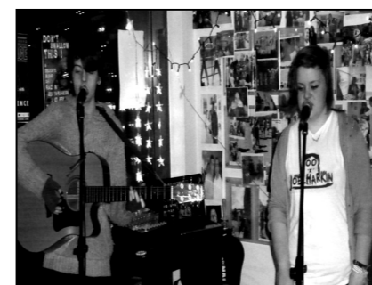
OPEN MIC participants

Letterkenny C.D.P S.T.A.R.T. Project also aims to reduce the harmful effects of drugs and alcohol to our community by providing alternatives and this has worked especially well with our Open Mic Project. Over the last year, Open Mic Letterkenny has been running monthly events hosted by Port Na Failte and organised by Letterkenny C.D.P. S.T.A.R.T Project offering a safe space and platform, show off their talent, to grow, build self confidence and network. An additional attraction is the drug and alcohol free environment and the provision of a free non alcoholic cocktail bar. So if you , would like to recite a poem, sing a song, play a tune, perform a dance, act a piece from Shakespeare, stand on your head, clown about or just watch others do it, meet other people and have some fun, then please come along to join this fabulous alcohol free event. All free, all welcome. Check us out on Facebook, Open Mic Letterkenny.