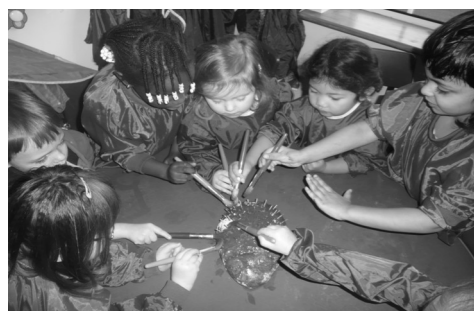
Children learning a new experience of the natural world by making their Autumn Hedgehog