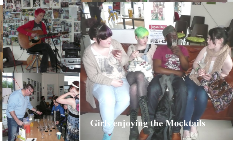
Girls enjoying the Mocktails