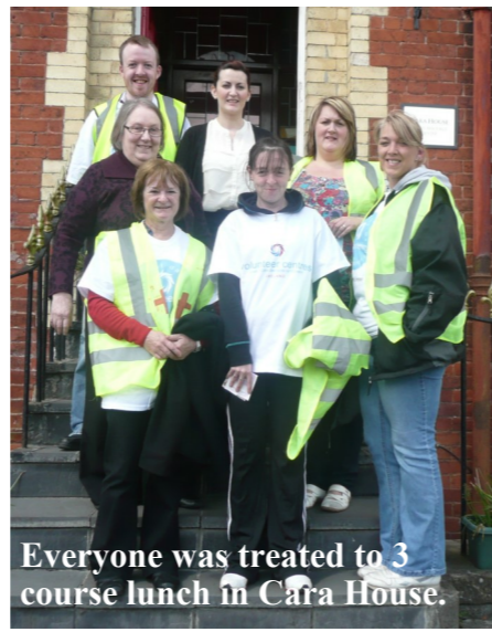
Everyone was treated to 3 course lunch in Cara House.