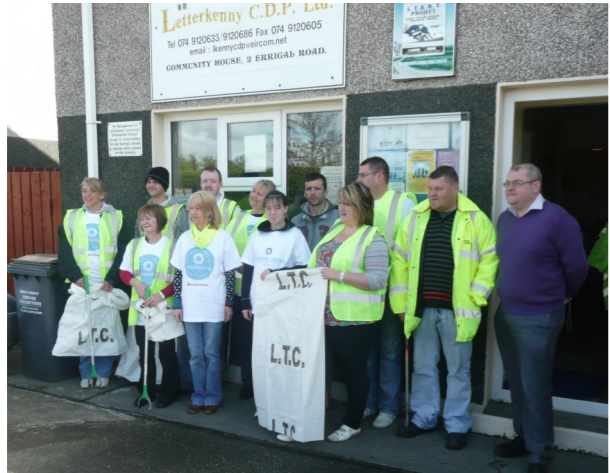
Ready for the off as Letterkenny C.D.P management , workers, volunteers and Tús workers set out from the C.D.P. community house down to market square on street clean /check.