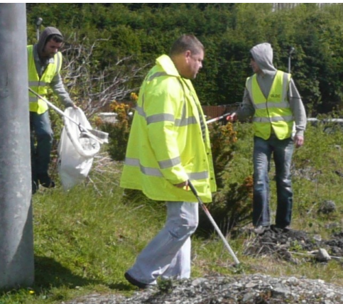
D.C.L.D. Tús workers covering waste ground on the High road.

This evenings offerings were Chicken A Lá King and Double Chocolate Brownies..