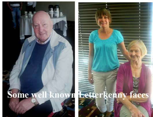
Some well known Letterkenny faces