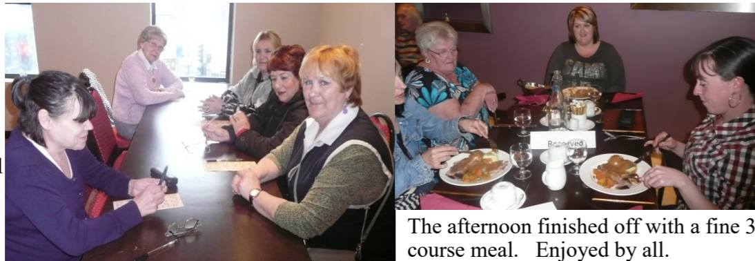
The afternoon finished off with a fine 3 course meal. Enjoyed by all.