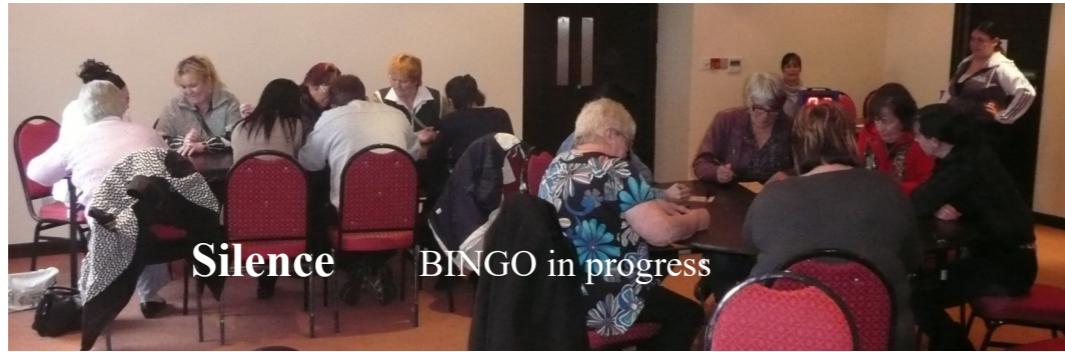
Silence BINGO in progress