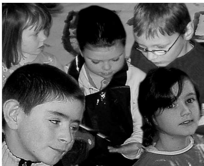
Letterkenny C.D.P. Youth and Caw Youth Derry enjoying cross border workshops recently.