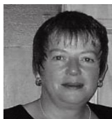
Mgt. Toner Co-ordinator