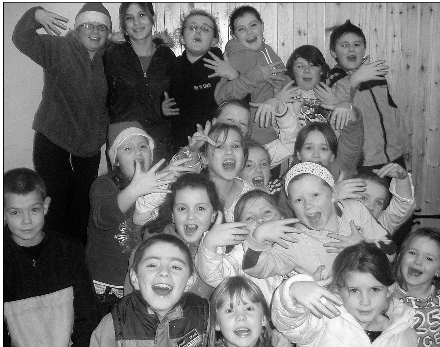
Children enjoying a Christmas Party organised by Letterkenny Community Development Project