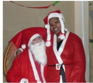
Santa Clause and Mrs Clause at the Intercultural Christmas Party