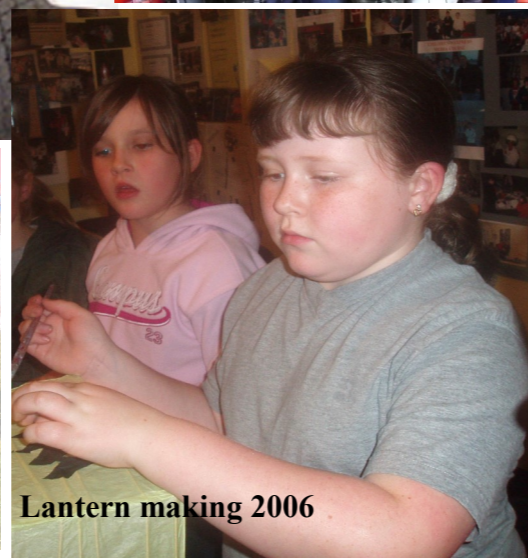
Lantern making 2006