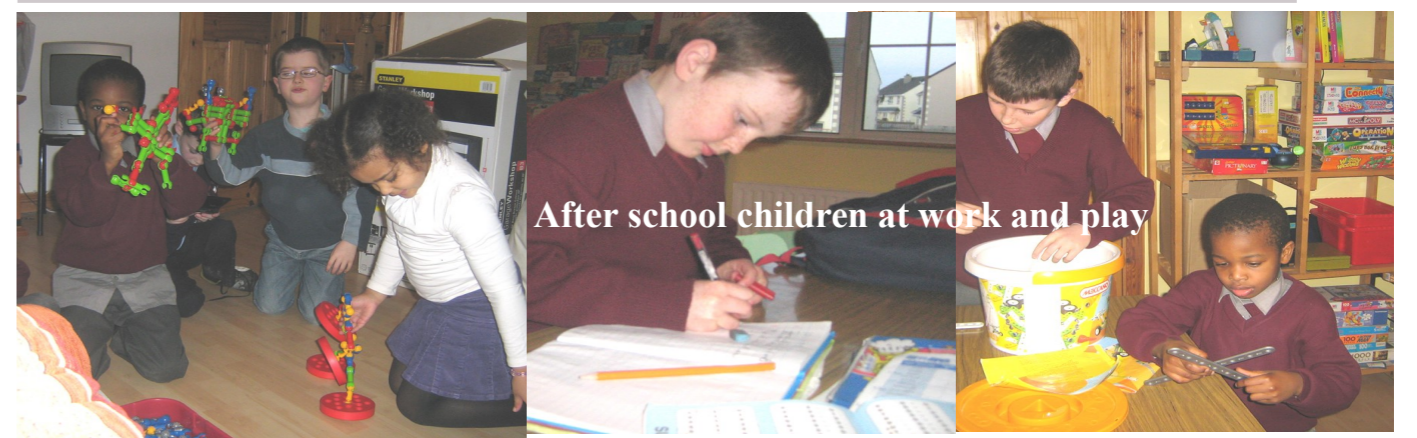
After school children at work and play