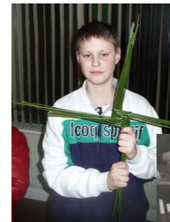
The Younger Generation enjoying the St. Bridget's Cross Making with Letterkenny C.D.P.

To advertise in this Newsletter Please Call Community House 2 Errigal Road Letterkenny. Tel: 074 9120633