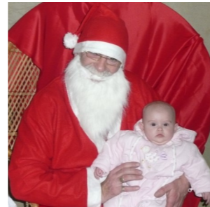
Dear Santa Clause please bring me ??????