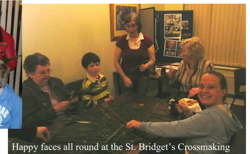
Happy faces all round at the St. Bridget's Crossmaking