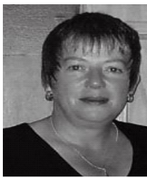
Mgt. Toner Co-ordinator