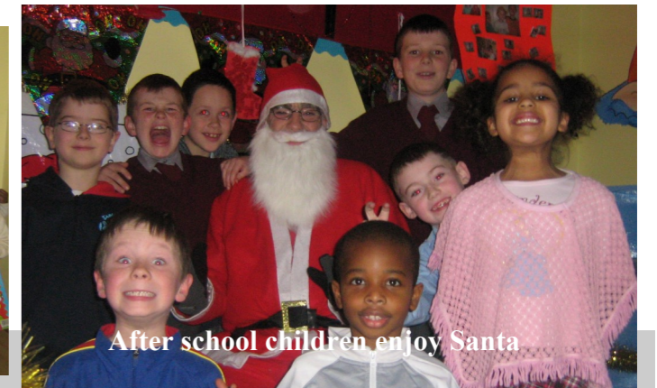
After school children enjoy Santa