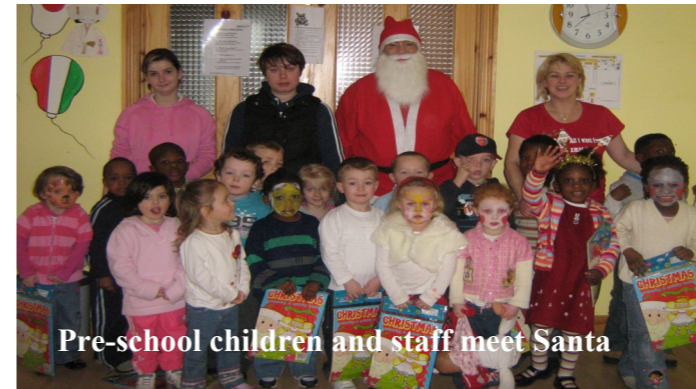
Pre-school children and staff meet Santa