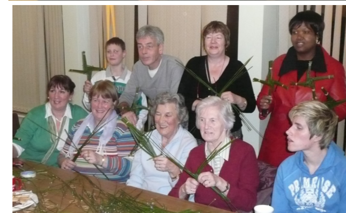
Enjoying a nights Craic at the