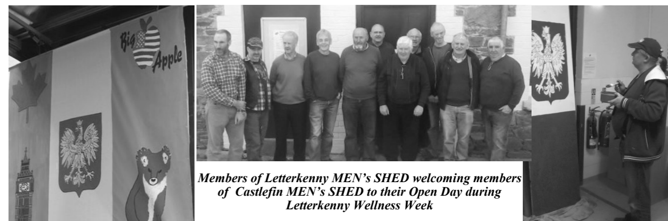
Members of Letterkenny MEN'S SHED welcoming members of Castlefin MEN'S SHED to their Open Day during Letterkenny Wellness Week

Letterkenny Men's Shed (based in Old Laundry St. Conal's Hospital) Opening Hours Mon = 9am to 5pm Tue = 9am to 5pm Wed = 9am to 1pm & some evenings subject to interest